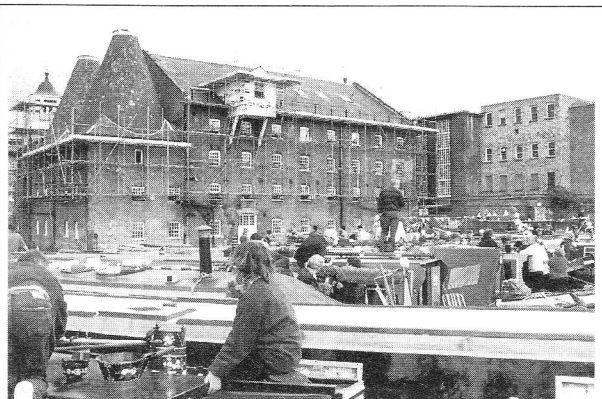
Boats rafted-up across the mill-pool for the opening of an earlier Three Mills Rally

On Monday 28 th July, South London Branch will organise a cruise on the tideway from Limehouse to Teddington, mainly for boats en route to the "National".